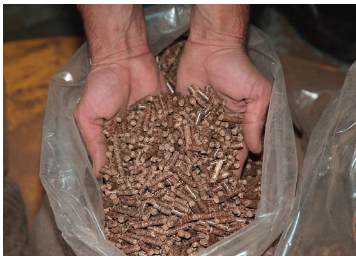
The first unit of bio-fuel production

integration, market liberalization and environmental protection, it is being reconsidered.