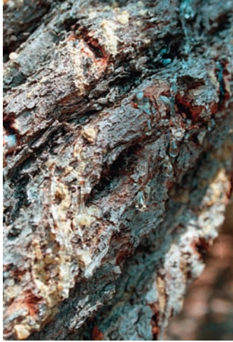
Mastic tree's trunk from the island of Chios

Starting in the sector of competitiveness, the Greek government has promoted a series of structural changes, measures and policies over the years, aiming at the cultivation of a steadier and more fertile environment for businesses. In this way, there is the gradual development of an environment favorable for investments in quality, research and innovations which promotes the development of even more ambitious business plans and provides incentive for the manufacture of value-added products.