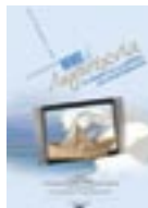
LITERATURE AND THE MEDIA