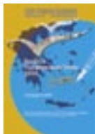
GREEK REGIONAL PRESS