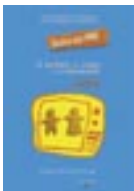
CHILDREN AND MASS MEDIA